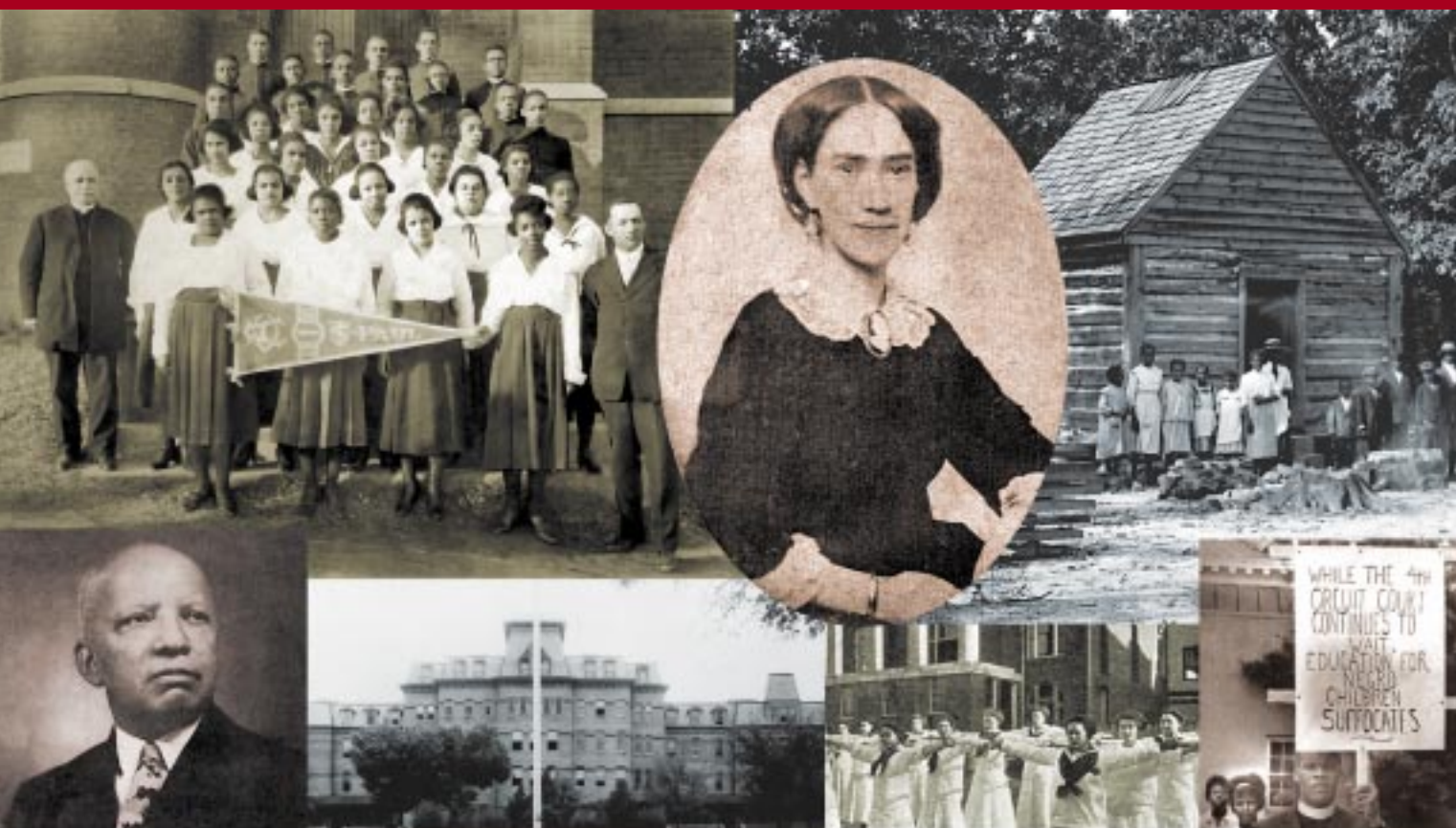
(Clockwise from top left) 1921 Graduating Class of St. Paul's College - Site No. 39 • Mrs. Pattie Hicks Buford, c. 1880 - Site No. 40 • One-room school, c. 1910s - Site No. 4 Beulah AME Church, 1963 - Site No. 27 • Blackstone Female Institute, 1908 - Site No. 18 • Virginia State University - Site No. 11 • Carter G. Woodson, 1937 - Site No. 5

The R.R. Moton High School is Site No. 24 on the Civil Rights in Education Heritage Trail